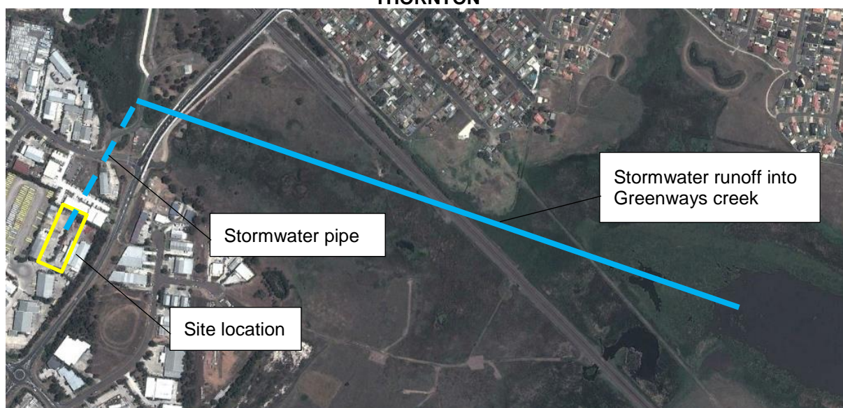
FIGURE 3.1 SITE LOCATION OF THE SUPAGAS GAS CYLINDER FILLING FACILITY THORNTON