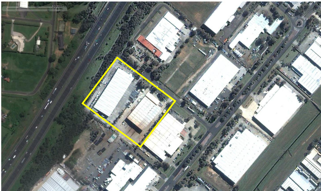
FIGURE 3.1 SITE LOCATION OF THE SUPAGAS GAS CYLINDER FILLING FACILITY INGLEBURN