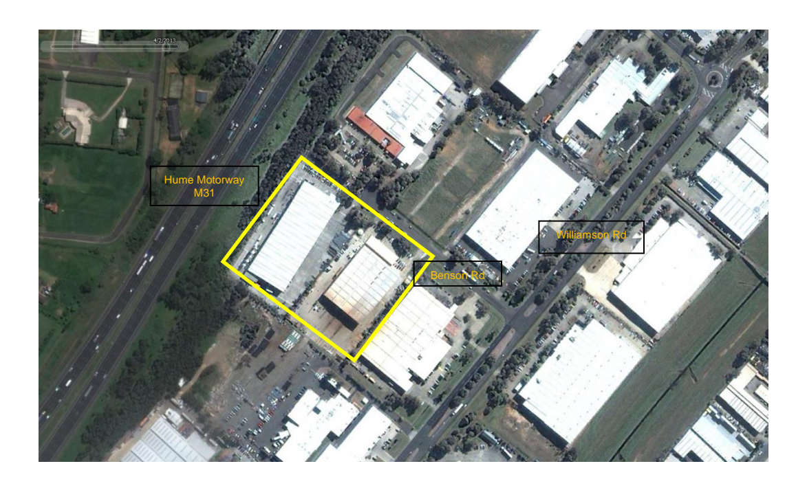
FIGURE 3.2 SUPAGAS SITE MAP