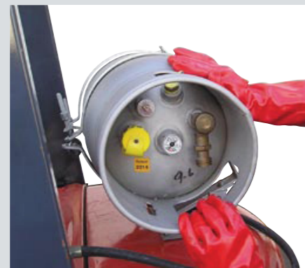
4. WATCH FOR ESCAPING GAS FROM FUEL LINE