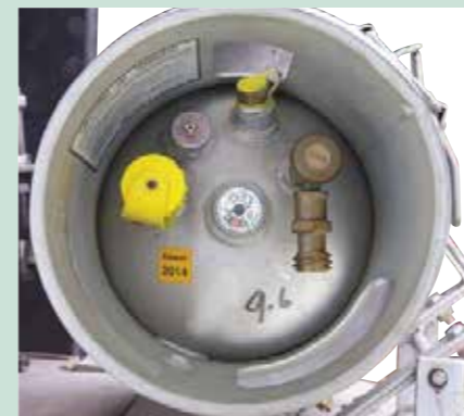
4. ENSURE TAP IS TURNED OFF ON GAS CYLINDER