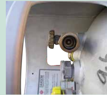
2. ENSURE O-RINGS IN FORKLIFT VALVE ARE IN GOOD CONDITION. SEE ADDITIONAL SAFETY TIPS SECTION.