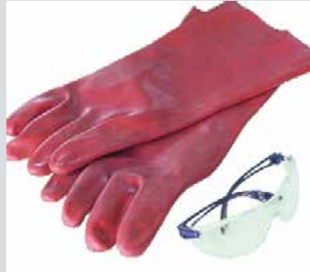
1. PUT PROTECTIVE EQUIPMENT ON