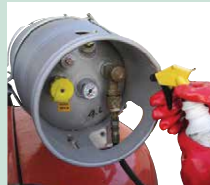
7. SPRAY CYLINDER WITH SOAPY WATER TO ENSURE THERE IS NO LEAKAGE