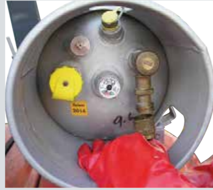
3. UNSCREW GAS CONNECTOR