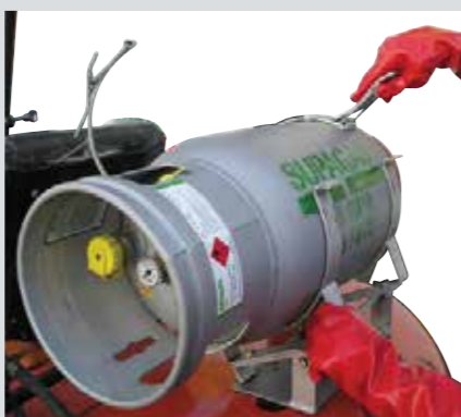
5. UNDO BRACKETS ON FORKLIFT