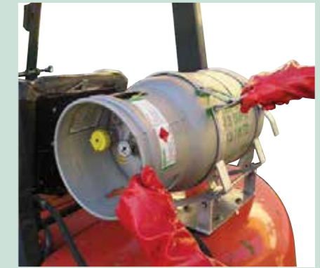
3. ENSURE PRESSURE RELIEF VALVE IS AT THE TOP AND THEN SECURE BRACKET HOLDERS