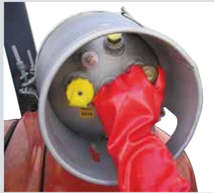
2. TURN GAS CYLINDER VALVE OFF