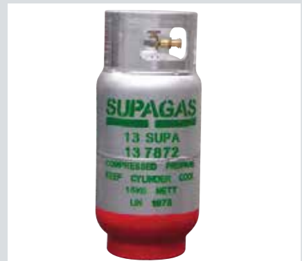
7. ALWAYS STORE GAS CYLINDER IN AN UPRIGHT POSITION