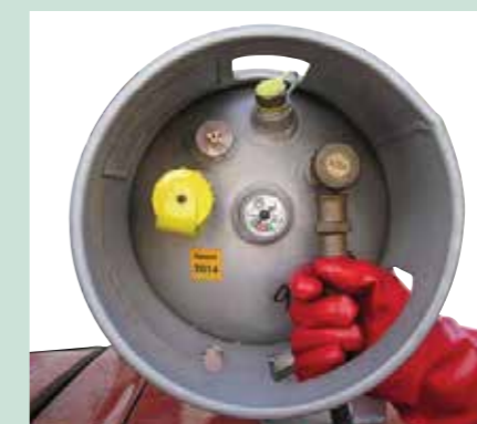
5. CONNECT FUEL LINE HOSE TO GAS CYLINDER