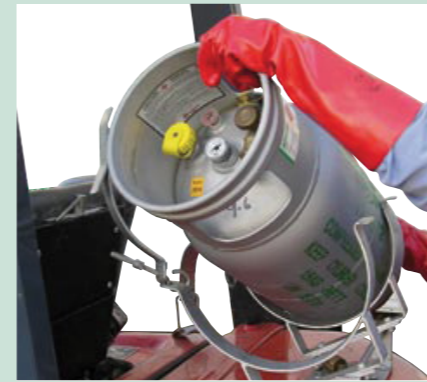
1. PLACE CYLINDER IN MIDDLE OF BRACKETS ON REAR OF FORKLIFT