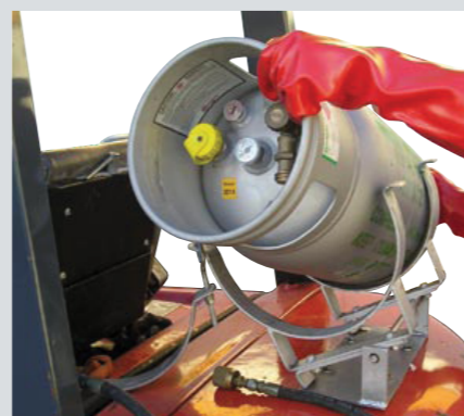
6. REMOVE CYLINDER