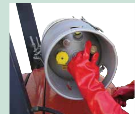
6. TURN GAS CYLINDER VALVE ON