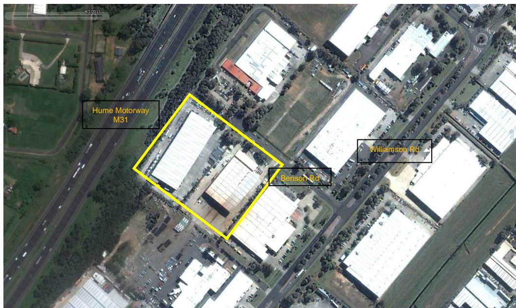
FIGURE 3.2 SUPAGAS SITE MAP